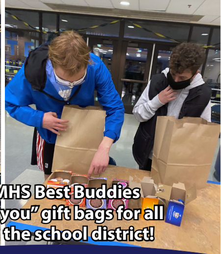
Members of MHS Best Buddies made "thank you" gift bags for all custodians in the school district!